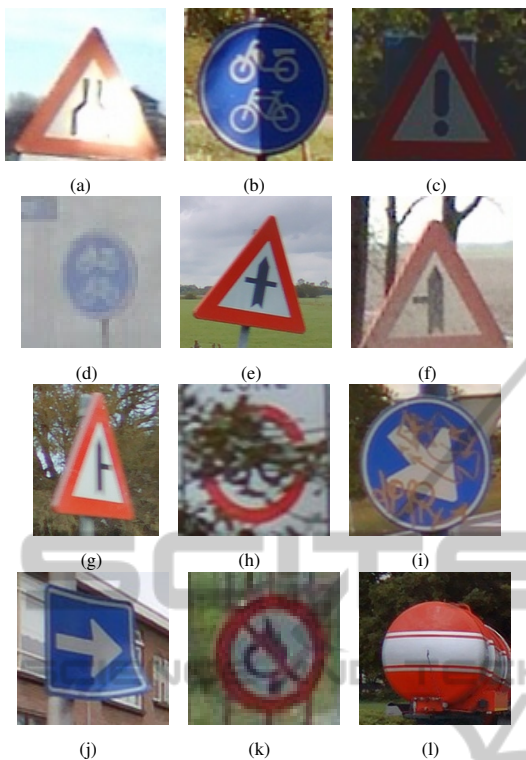
Figure 1: Illustration of challenges for traffic sign recognition from driving vehicles. (a)-(d) signs captured under challenging weather conditions. (e)-(g): sign types with very small inter-type variations. (h)-(j): signs with lowered visibility. (k)-(l): sign look-a-like objects.

for several reasons. At first, recording in outside environments implies that the capturings are taken under a wide range of weather conditions. Furthermore, capturing from a driving vehicle may result in motion blur or occlusions by e.g. other road users. Second, a large variety of sign types exist, from which some only vary in small details. Besides this, some sign types are designed to contain custom texts and/or symbols, leading to very large appearance differences between instances of the same sign. Thirdly, the visibility of signs may be degraded, e.g. due to aging, vandalism or vegetation coverage, complicating sign detection. Fourth, there exist many sign look-a-like objects, such as e.g. signs for restricting dog access or directives to customer parking, which are not official traffic signs. Examples of these challenging factors are portrayed by Fig. 1.