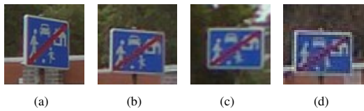
Figure 4: Illustration of a 3D sign. All corresponding detections are shown, sorted by the capturing-to-sign distance.

Both methods employ SIFT descriptors (Lowe, 2004), which we extract from a dense grid at five different scales, after normalization of each image to a pre-defined size. All descriptors are matched against a precomputed codebook resulting in a histogram, containing the number of matches for every codebook entry. This forms the BoW part of the feature vector. The structural part of the feature vector consists of the concatenation of the descriptors extracted at the middle scale. Both parts are normalized independently using L2 normalization, and are concatenated afterwards. The resulting vector is classified by a linear SVM, using a One-versus-All classification approach. This approach correctly classifies about 93% of the individual detections.