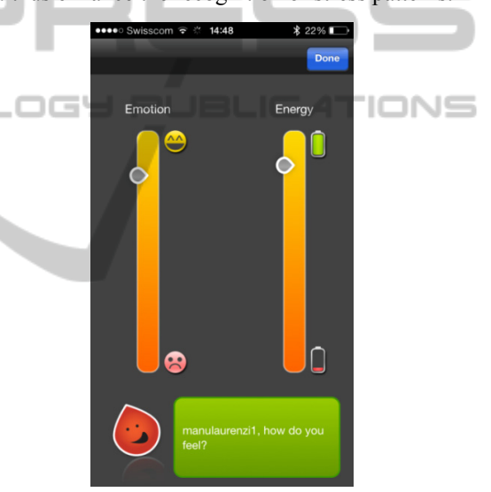
Figure 4: Mood Map.

the mood will allow the learning algorithm in the backend to obtain a more adequate as well as a more comprehensive assessment of the user's stress levels and thus enhance the recognition of stress patterns.