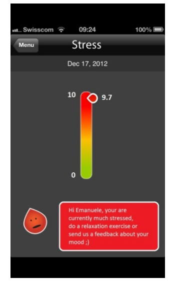
Figure 1: Current Visualisation of HRV values.

The HRV values obtained are aggregated to provide an overall measurement of the stress level on a scale from 0 to 10 (see Figure 1).