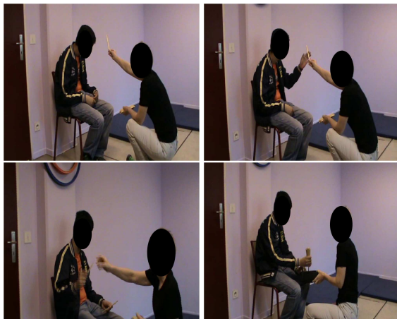
Figure 1: Sample frames from the "grab the stick test".

As a first step towards our automated analysis system, we will focus on a single activity of the assessment. We shall refer to it as the "grab the stick test". For this particular test, the child is invited to sit on a chair and the psychomotrician usually kneels down in front of him/her. Then, the psychomotrician sequentially presents to the child a series of identical wooden sticks from different starting points in space and in distinct orientations. Ideally, the child is expected to grab one stick at a time with one hand and keep the previous ones in the other hand. When the activity is completed, the child is asked to store the set of sticks in a pencil case and close its slide fastener. Figure 1 shows a few sample frames extracted from the video passage containing this activity.