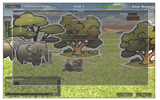
Figure 3: A Scene from World of Balance Game (Unity3D Client), showing the biomass of the species within the game.

This game focuses and extends the scope of game from simple entertainment or education further into Gamification or crowd computing that enables scientific data collection through game play. While players are playing an ecosystem nurturing game, they are also producing data that can be meaningfully used by ecologists (Yoon 2013). Details of game can be found at the given web site (http://smurf.sfsu.edu/~wob/). This game project presented additional challenge of understanding