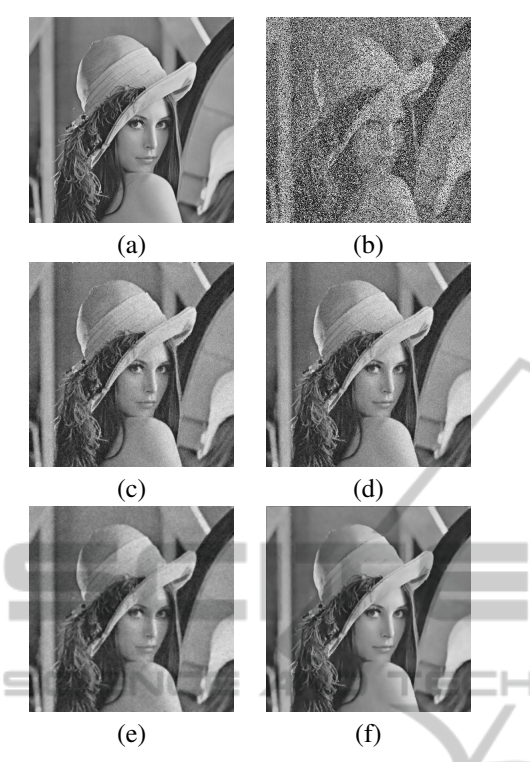
Figure 1: Denoising results of different algorithms on Lena image corrupted by noise variance ( \sigma =15) and impulse noise density (p = 50%). (a) Original image, (b) Corrupted image, (c) TP (Jian et al., 2008), (d) FTPID (Jian et al., 2010), (e) AF, (f) Proposed Method.