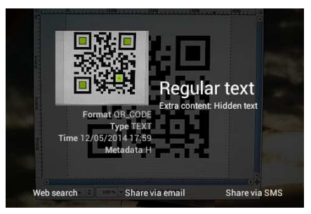
Figure 3: Application: reading code.

The application is based on the ZXing library (Zebra Crossing Barcode Scanner Library) (ZXing, 2014), which was modified to write and read QR codes with hidden information according to the method described using the 8 bit encoding. The application has been tested with the QR Versions 1-20 and the four levels of error correction. The rest of the QR Versions should also work.