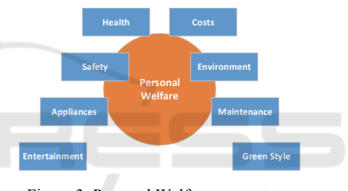
Figure 3: Personal Welfare parameters.

Long-term investments in the system will lead towards long-term welfare of the inhabitants residing in the area of a cellular microgrid. This welfare will be in the form of job opportunities in a local market place. This aspect has always been neglected and is very important for future investments and also to strengthen national social goals by reducing inflation.