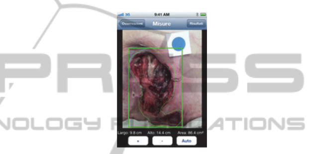
Figure 2: Screen of MOWA application calculating the wound area (Healthpath, 2011).

collects your data with or without the Internet, performs powerful, accurate and consistent assessments for wounds, generated progress, area and dimension charts, shares patients data securely with their affiliated accounts, tracks vitals, medical conditions, and report on open or closed wounds, calculates and analyzes wound data to drive better care and better results, reduces redundancy, keeps compliant, improves revenues and decrease wound care costs by lowering re-hospitalization rates and increasing referral rates and decreases maintenance costs. WoundRight application is only for tablets, is supported for Android and iOS operating systems and it is free.