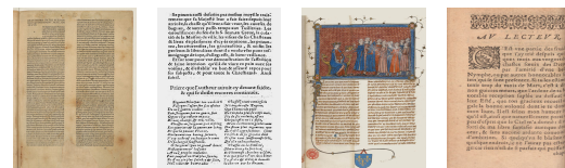
(a) Only two fonts (b) Only three fonts (c) Graphics and one text font (d) Graphics and two text fonts