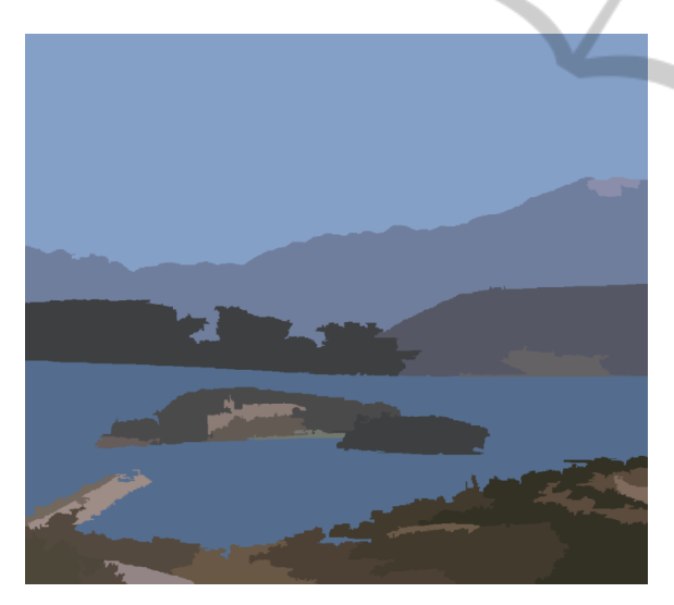
Figure 1: High resolution image segmentation with the single detected sky region. The algorithm has merged the regions that were not smooth, creating a single region for the sky. The skyline can then be easily extracted to be used for image registration and produce the final result.

To provide the above functionalities and visualizations, various algorithms have been implemented. The system implementation stores the images and the semantic maps in a relational database (Christodoulakis et al, 2009) and provides retrieval functionality for both. The maps are acquired from a semantic map server and can be personalized according to user interests. For example, if the user is interested in the archaeological or cultural sites of Crete but not in its geographic features, the server can then provide a version of the map of Crete without the geographic semantic objects. Ontologies play an important role in our system. The system is interactive and the user can add its personal ontology tree where ontologies have a number of semantic types and semantic objects belong to these types, forming a hierarchy.