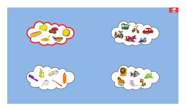
Figure 2: Screen of Theme Selection.

children. The game was developed in Python programming language in association with Pygame, a set of libraries for game development in Python. In the game's interface and interaction environment, the recommendations suggested in the guidelines were followed.