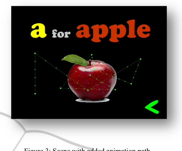
Figure 3: Scene with added animation path.

Each of the letters in the screen shown in Figure 2 will be turned into a button that leads to an action. The learner has to add the required components and thus practice the process from the earlier learning activity. (The letters and heading are all originally added as text.) The symbol requires the adding of a picture and the action script required is like that of the original button but the appropriate action had to be added to the letters which themselves had first to be converted into "buttons". While the next stage can be more or less derived from the previous the level of "scripting" required increases as the action now becomes more complex leading to the need to create an animated scene after an intermediate button press (see Figure 3). However, the repeated process has a lot of commonality so it should be possible for the participants to begin to understand the value of generalisation (one of the CT skills) and apply this by adding function calls to the Action Scripts to allow common code to be reused. This would not be done in early exercises as the needed instruction for using such functions is not given early in the set of tasks. Figure 3 also shows an additional feature that is taught at this point. The green path shown in the figure is added as the movement route (Tweening in Flash Action Script terminology) for the apple to follow during the animation that will be prescribed in the script.