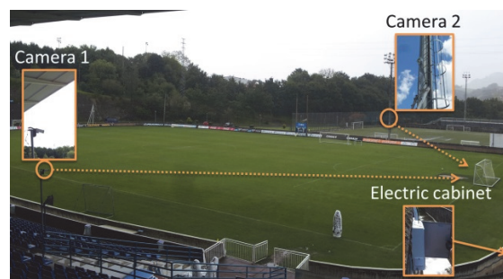
Figure 1: Capture system (two cameras and a PC) localization in the football field.

As can be seen in Figure 1, the system consists of two synchronized cameras strategically placed on both sides of the field and focusing to the goal. Both cameras are controlled by the PC which is inside an electric cabinet.