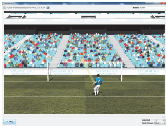
Figure 4: Shot visualization application showing the trajectory of the ball, the player and the spectators.

As stated before, the user can visualize any shot captured by the VTS | Football system in order to analyse the trajectory more precisely (e.g. when the coach wants to show how the trajectory of the evolved to make the player see why the ball went out).