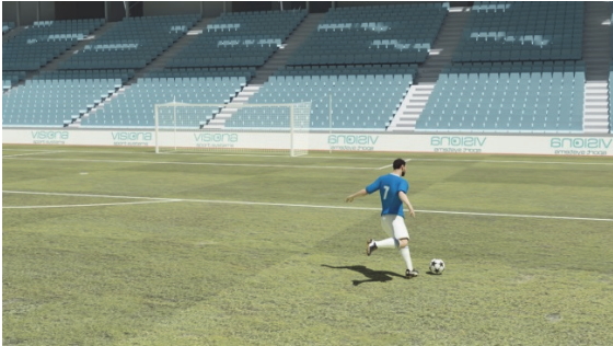
Figure 5: The virtual stadium and the virtual player that have been modelled for the application.

When locating the player in the field a new problem arises. The points of the trajectory that have been captured don't start at the floor; they are near the goal. Thus, a starting point, the point where the virtual player kicks the ball has to be computed.