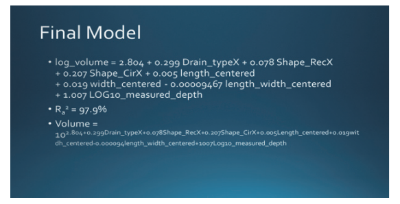
Figure 3: Slide from CTO presentation to show how drain volume can be calculate based on a multiple regression model. This equation is based on two semesters of data.

this new point. After the statistical analysis portion of the project was complete, city IT staff again attended the student presentations of their data. The CTO also presented to the class how the collected data was being used and also showed how the data from the previous classes had been used to build a maintenance schedule for the storm drains that had depth information collected on them (Figure 3).