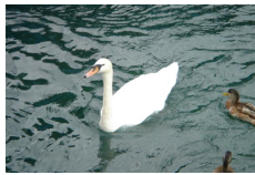
(b) Negative Example.