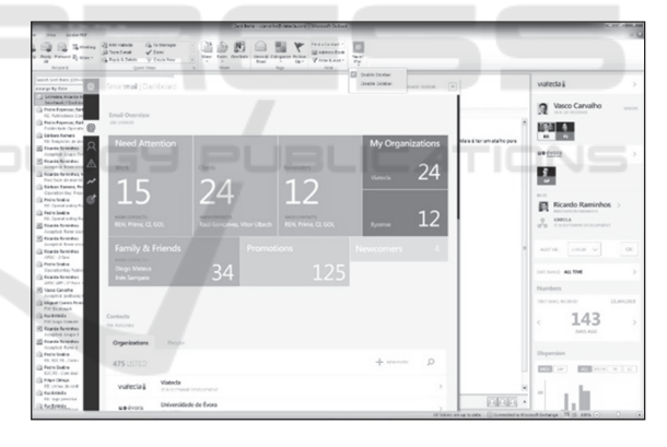
Figure 2: SMART Dashboard – global vision while integrated on Microsoft Outlook client.

The SMART Dashboard area can be accessed via a ribbon present at Microsoft Outlook top toolbar section. While the Dashboard is activated only "on request" by the user via ribbon, the Sidebar graphical component is always visible and is located on the right side pane of Microsoft Outlook application (Figure 2).