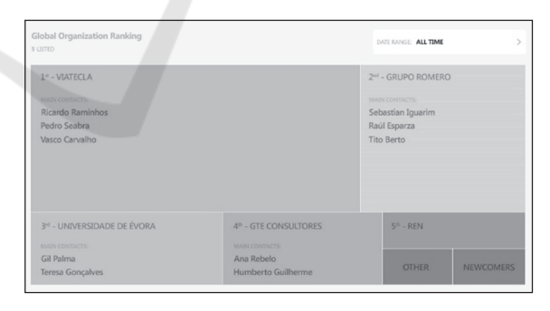
Figure 8: Graphical overview for the received emails associated with Organizations in a time frame.

The SMART Overview control (Figure 8) enables a graphical display using an area representation, where received email messages are mapped to the associated Organization within a time frame. The area size is proportional to the volume of received emails within the defined time frame.