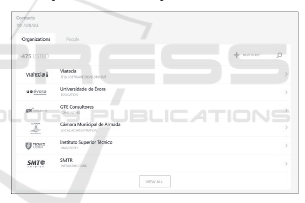
Figure 4: SMART Dashboard - Organization listing.

The "SMART Contacts and Organizations" area is activated any time the user (i) selects a Contact or Organization within any Dashboard area and intends to see its detail, (ii) navigates specifically to the area – using the left-side anchor button (Figure 3) or by scrolling on the Dashboard panel.