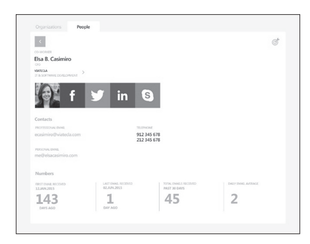
Figure 5: SMART Dashboard - Contact detail.

Figure 5 presents the detail for a Contact where, besides its associated information, a set of statistics regarding previous email interaction history between the user and the selected Contact is shown.