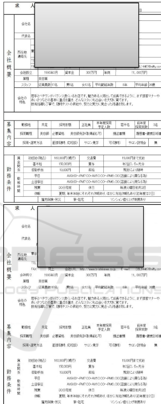
Figure 6: Line detection results.