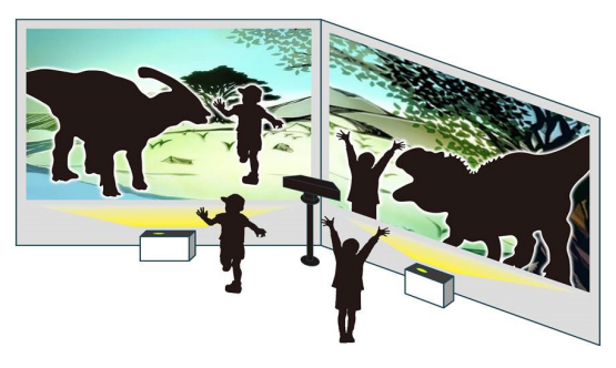
Figure 1: Concept of BESIDE.

We are developing "BESIDE" as an immersive learning system that enables learners to explore a virtual paleontological environment at any museum. BESIDE consists of various sensors and digital learning content. The sensors measure the learners' location, pose, and actions, and the learning content is then controlled according to these measurements. Figure 1 illustrates the concept of BESIDE.