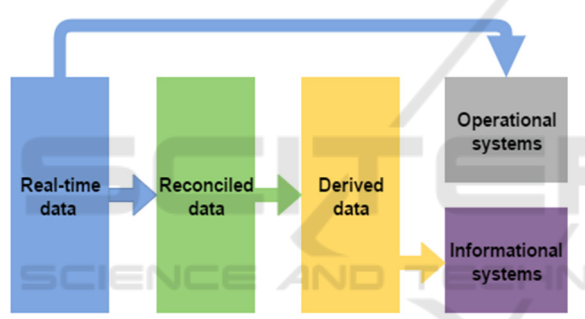
Figure 1: The outline of a three-layer data warehouse architecture.

The three-layer data architecture comprises real-time data, reconciled data and derived data (Devlin and Cote, 1996). The outline of the architectural framework and its data flow are depicted in figure 1 below.