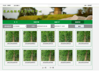
Figure 3: Wheat picture selection screen

nutritional diagnosis result after the image processing for selecting the wheat images, which analyzes the nutritional status judged by the content of chlorophyll and leaf nitrogen content of wheat.