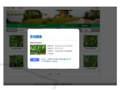
Figure 4: Wheat nutrition diagnosis interface