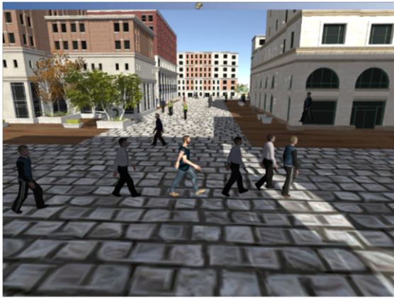
Figure 1: A 3D scene in which Andrea explores the city of Buenos Aires.