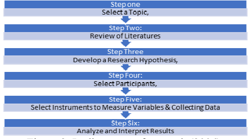
Figure 2: Lodico steps of research (2006).

The data collected for this research was taken from 2017 period and the proposals analyzed were picked up randomly for this research. The proposals were analyzed and interpreted comparing to 2012 AECT Standards. Based on the data analysis and then use the 2012 AECT Standard as comparison, we mapped the internship design that has been done and draw the whole figure 2 about the design of internship program.