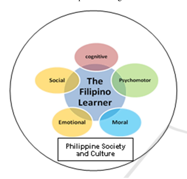
Figure 2: Attributes of the Filipino learner.

movement skills can now be used and apply to daily life activity. As the person matures in age and enter adulthood the hourglass will turn over. The social and cultural factors will come in as it influences one's lifestyle. Lifestyle is determined by physical fitness, nutritional status, diet, exercise, the ability to handle stress and social and spiritual being.