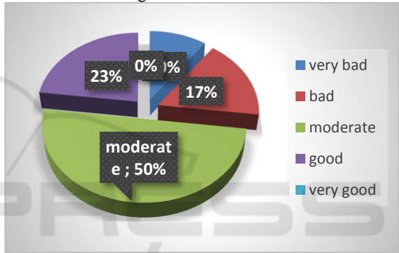
Figure 1: Perception of Quality of Life.

The first question in the WHOQOL-BREF questionnaire is about general perception of the respondent on their quality of life in the past four weeks. Respondents' answers for the first question is described in the figure below.