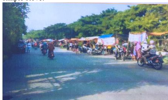
Figure 2: The stalls for smoked fish traders are usually located along roadside of Kejawan Lor.

selling smoked fish. Approximately 30 smoked fish traders sell their products by opening a stall along the edge of Jalan Kejawan Lor, precisely in front of the Beach Amusement Park (THP) Kenjeran. Some of them fish-wash in the river near their stalls before starting the process of fogging. Then, in the early hours, usually these merchants start smoking with a simple stove.