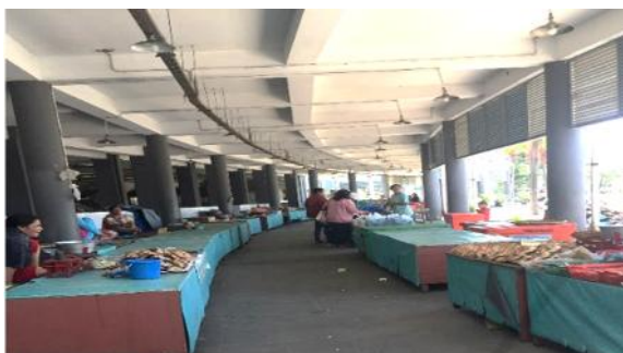
Figure 4: Sentra Ikan Bulak (Bulak Fish Center) is not as crowded as the other traditional market, there is almost no buyer.

Center), but then they went back again to the old location. Subsequent resolution of the fifth conflict was carried out by the sub-district apparatus on July 19, 2016 through negotiations. The result of the negotiation was the expectation of the smoked fish traders for Sentra Ikan Bulak (Bulak Fish Center) location; in addition, there should be the place to sell smoked fish and food products made from smoked fish and entertainment events to attract the public attention. The response of Surabaya City Government is to fulfill all suggestion from the people bloaters, but these efforts have not succeeded until nowadays.