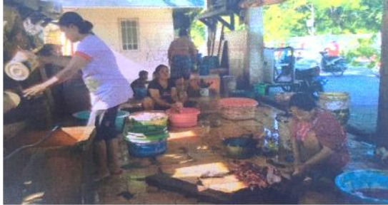
Figure 3: Fish washing process.

Unfortunately, the existence of fish traders caused troublesome among the local people. Various public complaints against the activities of the fish traders such as the smell of smoke that is easily attached to clothing, air pollution, traffic fluency is disrupted, the environment becomes dirty. This issue is ultimately a burden for the Surabaya City Government.