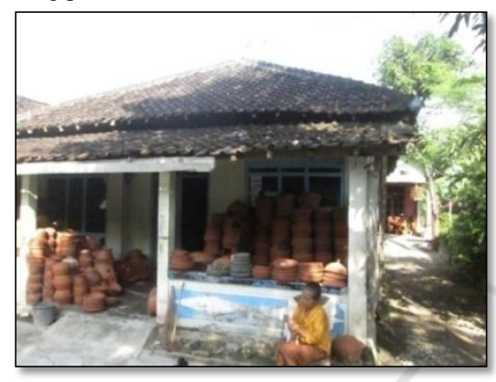
Figure 4: One of intermediary trader's house.

Lots of pottery in the intermediary trader's house because it is difficult to sell (figure 4). As a result of this condition, the intermediary trader's capital does not return immediately. Meanwhile, many craftsmen lose money because the cost of production offered by an intermediary trader ( bakul ) is almost equal to the selling price.