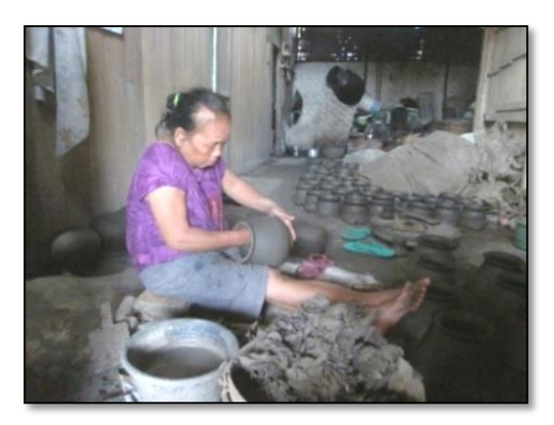
Figure 1: Pottery crafters Paseban Village.

The condition of the decline in the number of craftsmen is expected to continue because most of the surviving artisans are the older generation (average age above fifty years). Meanwhile, most of the surviving craftsmen 's children already have jobs in other sectors and are not continuing the family business of making pottery.