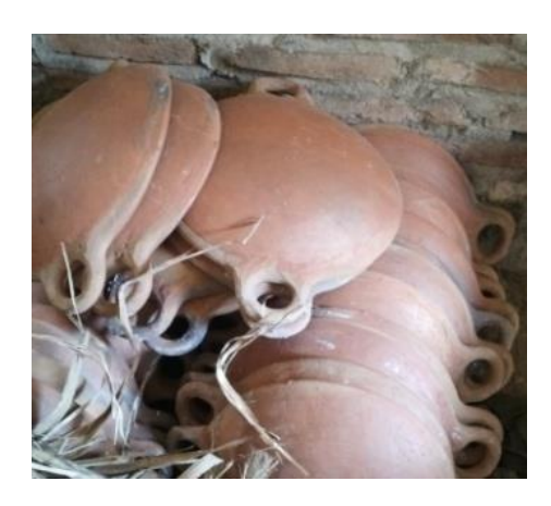
Figure 3: Traditional wok (wajan).

The cookware in figure 3 is wok ( wajan ). It is one of the many products produced in Paseban Village commonly used for frying food. Users do not have to worry about crack because the main characteristics of pottery produced in Paseban Village are fireproof. There are also another household appliances like pot for rice cooking ( kendil ), traditional stoves made of clay ( keren ) and clay pot ( kwali ) with a large size.