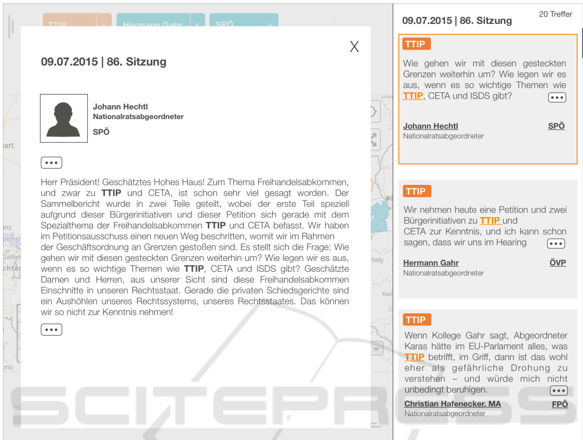
Figure 3: Detailed View: By selecting an excerpt, the detailed view is shown as an overlay with details of the transcript, name, function, and portrait of the speaker.

(Present the related \Rightarrow Provide the context \Rightarrow Self-organized exploration). By starting within the detailed view and going from the map to concentrating on the dataset filtering on one specific aspect of the data, reverse exploration is achieved.