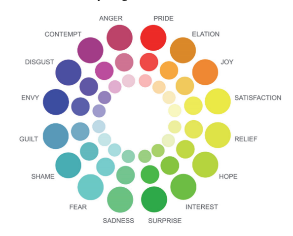
Figure 3: Adapted GEW version 1.0 in this study.

We made some adaptations for using this instrument with children. We chose to decrease the number of intensity degrees from four in the GEW