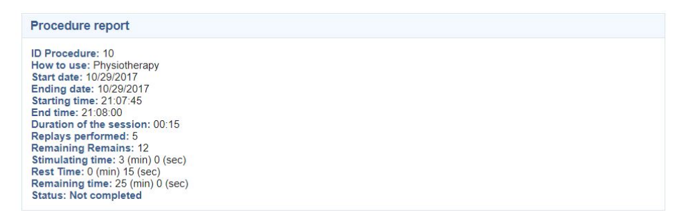
Figure 6: Web application screen showing summary information of a procedure.