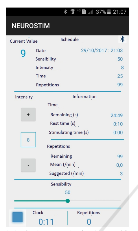
Figure 2: Application screen showing the control functions and readings from the neuroprothesis.

Also, the health professional can visualize data from all the procedures executed by each patient. Information regarding sEMG and usage parameter will be shown in a graph (Figure 5), along with a summary with relevant information about the respective procedure (Figure 6).