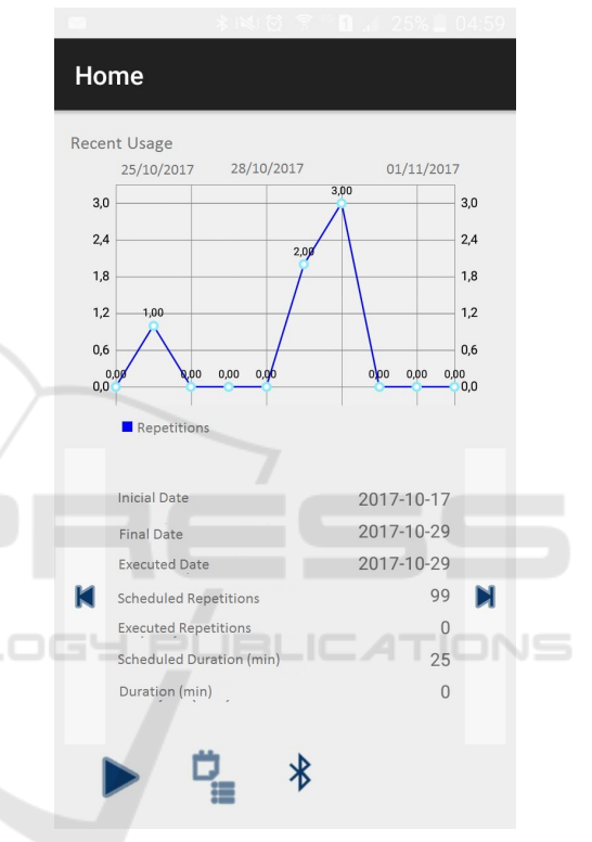
Figure 1: Application screen showing historical usage data.

Upon start, the application synchronizes all data available at the server side for the logged in user. All information regarding historical data and agenda of usage will be available for consult, as shown in Figure 1. Depending on the setups made by the health professional, the user will have the possibility to choose between modes of operation, maximum intensity, etc.