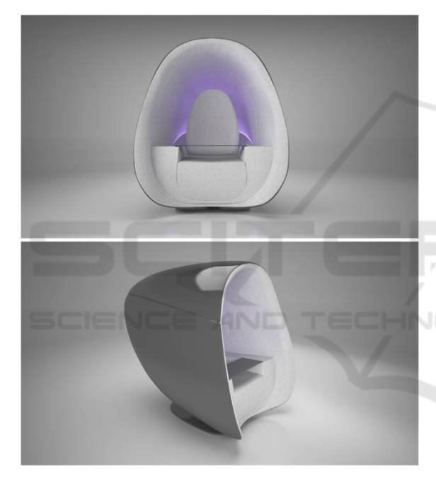
Figure 4: some of the 3D renders of the envisioned interactive seat.

conductive fabric with a thin conductive thread to build two squares (matrix) for the seat and its back. These allow to track the user's posture and presence.