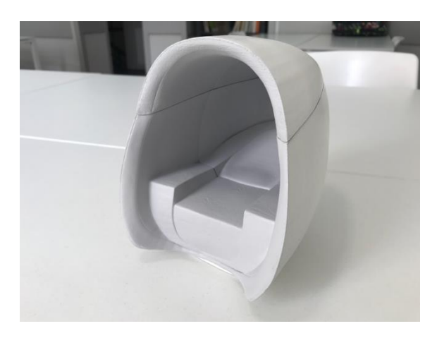
Figure 3: 3D-printed prototype.