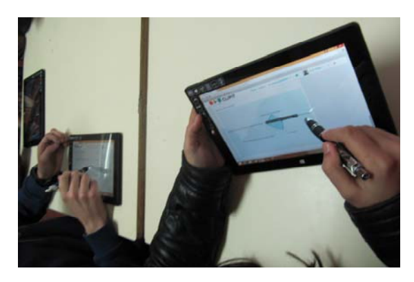
Figure 2: Students checking the quiz radar charts.

Figure 2 shows a student verifying the result obtained in the questionnaire.