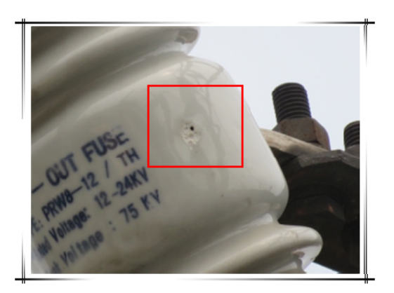
Figure 5: Practice effect of power equipment intelligent detector 1

5.1 Achieve hidden danger identification for 360-degree of safe and all-weather. charging power equipment in high-altitude; implement 360-degree high definition video inspection in all directions in the operation condition of pole tower; realize running equipment temperature measurement, partial discharge and internal defect hidden dangers simultaneously; solve equipment hidden dangers that cannot be found by routine inspection basically