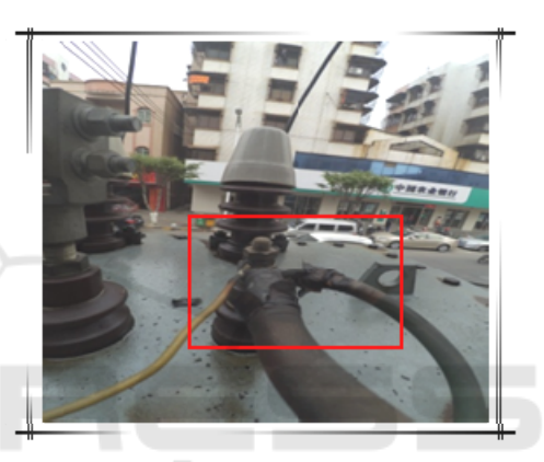
Figure 6: Practice effect of power equipment intelligent detector 2

5.2 Achieve charging transcripts and conversion equipment data of information, do not contact with adjacent charging equipment, no risk of electric shock, and eliminate electric shock risk of copy information for staff. The organic combination of instrument and insulated expandable rod and realization of safe operation of operation and maintenance and charged equipment without using pole mounting can reduce risk of high-altitude falling and electric shock effectively, and solve personal safety problems of power operator and maintainer during inspection operation basically.