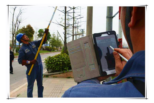
Figure 4: Prototype of power equipment intelligent detector

The use of "mine sweeper" has realized close-range hidden danger identification for 360-degree of all-weather, safe and charging power equipment in high-altitude without hidden corners, and discovered equipment hidden dangers that cannot be found by routine inspection, which reduced ascent work greatly, improved operation and maintenance quality and efficiency, relieved pressure on owner of equipment operation and maintenance, and won general consent of teams and groups.