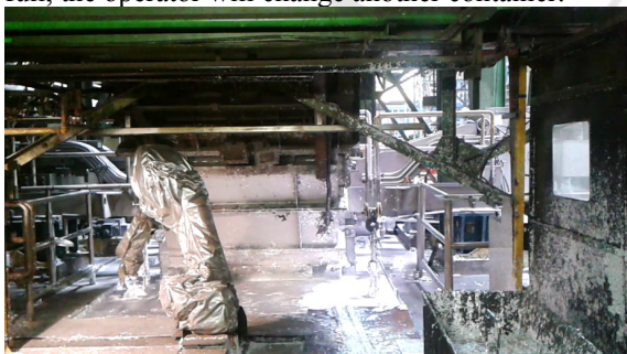
Figure 2: Danieli Group Q-ROBOT ZINC

Q-ROBOT ZINC of Danieli Group (MerluzziA, 2017) is widely used. The working principle of Q-ROBOT Zinc is based on an industrial 6-axis anthropomorphic robot with its own control system that skims the surface of the zinc bath to remove dross, and places it in a dross container, using a specially designed tool as shown in figure 2. At last, when the container is full, the operator will change another container.