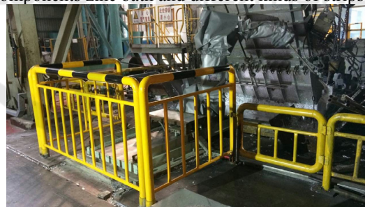
Figure 3: On-line dross removal robot system developed by CISRI and MaStell

Demonstration project (Figure 3) of galvanized line dross removal robot developed by CISRI and Masteel jointly, realizes the whole requirement of users correctly in May 2017. The dross removal robot belongs to the third-generation industrial robot, which took the bath pot and its peripheral equipment into consideration, with the characters of high intelligence, reasonable configuration et al. It was designed according to operating habits and processes. The process has reached the advanced level of similar products in developed countries, which contains 22 kinds of processes (Figure 4) for different components zinc bath and different kinds of strips.