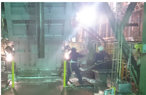
Figure 1: manual operation