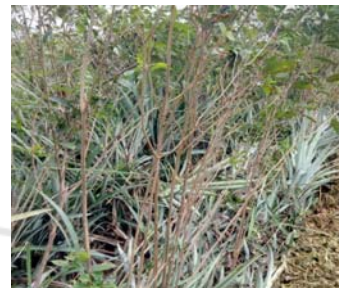
Figure 4: Fiber + shrub land.

c. The role of the ground wheel in addition to supporting the weight of the field machine, the work can walk with the ups and downs of the terrain changes up and down movement, so as to ensure that the rejection of knife and the ground gap remains unchanged, the crushed object stubble height change.