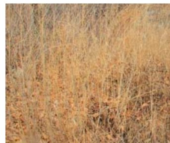
Figure 6: Macadam plots.

The mill uses the "strong down, first out of head, broken rod," the step-by-step overall work program, uniform design work machine width of 1.5 meters, double-roll structure, double rejection of knife thick