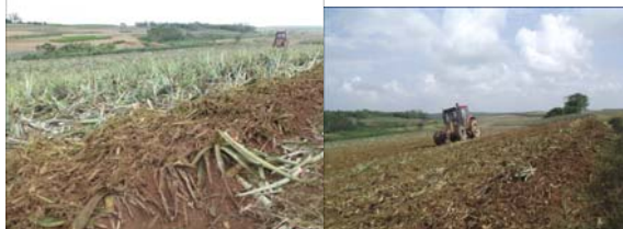
Figure 1: Traditional models crush effect.

strength and thick. Existing pineapple stems and leaves crushed into the field of pineapple machine into the ground, often to be 2-3 times the smash in order to make the crushing effect to meet the requirements (pineapple stems and leaves less than or equal to 15cm in the proportion of not less than 90%), see Figure 1 (a, b).