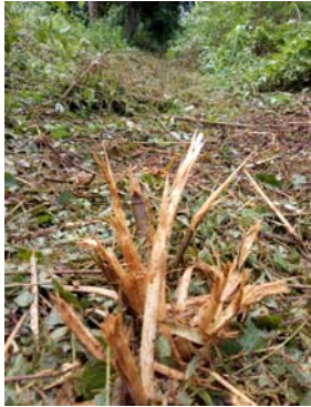
Figure 14: Rattan + shrub block crushed unqualified effect.