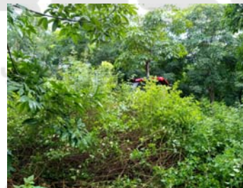
Figure 5: Rattan + shrub block.