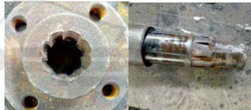
Figure 12: Drive system is damaged.

In the case of machine damage, still show a good quality of work, some of which work with the quality of the bulldozer can be comparable.