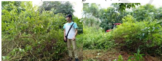
Figure 2: The upcoming work environment.

For example, due to the slow recovery of the global economy and the continuous decline in the prices of crude oil and other commodities, the world's natural rubber industry has shown a trend of oversupply. In recent years, the natural rubber in China has been discarded in large areas and abandoned. Recently, natural rubber has gradually started to resume tapping due to the obvious signs of natural rubber price recovery and favorable policies stimulated by the state for the natural rubber industry. However, for rubber tapping, the first step is to eliminate the shortage and the object to eliminate it is high over the tractor shrubs and run over people rattan and gravel and other environments, shown in Figure 2 (a, b).