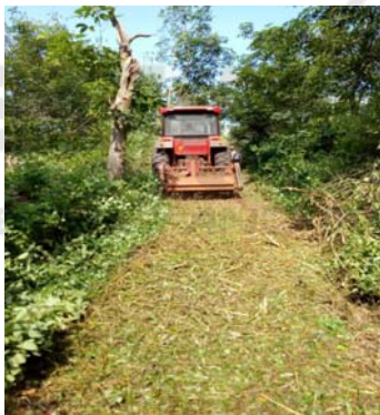
Figure 8: Crushing effect of rattan + shrub block.