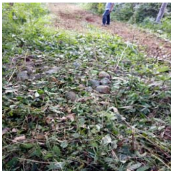
Figure 9: Crushing effect of Macadam plots.

During the test, the machine suffered various degrees of damage in varying degrees, including