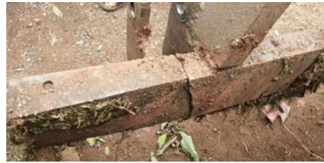
Figure 11: Rack cracking.