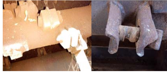
Figure 10: Broken blade and seat.

blade damage / rack cracking; drive system damage, and belt breakage / bearing burnout / transmission stuck. See Figure 10-12 for details.