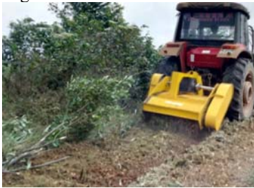
Figure 7: Crushing effect of fiber + shrub land.

The use of the above program in abc three kinds of work environment, the test results of the machine shown in Figure 7-9: