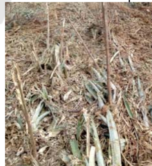
Figure 13: Fiber + shrub land crushed unqualified effect.

In the case of machine damage, still show a good quality of work, some of which work with the quality of the bulldozer can be comparable.