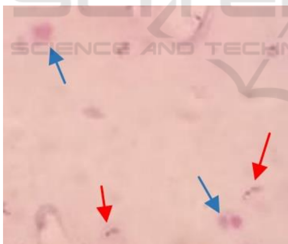
Figure 1. Microfotography of mixed malaria thick blood smear

Subject diagnosed as positive mixed malaria have 2 types of Plasmodium that is P. falciparum and P. vivax can be seen under microscope. The result of thick blood film examination as follow: