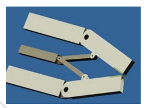
Figure 3: Designed scissors mechanism.

be guaranteed. As shown in Figure 3, an electrode which was necessary for the use of a high-frequency current was placed at the ends of the individual arms of the scissor mechanism. Figure 3 shows the mechanism in an active coagulation position. For better clarity, the prototype was expanded several times to allow observation by the naked eye. Another option was to use the eccentric length of the individual arms, but this would require even more pulling strings and better precision.