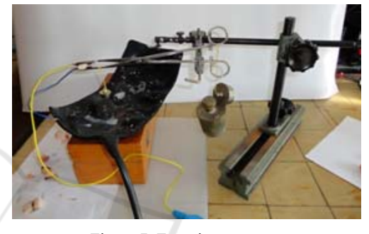
Figure 7: Experiment setup.

to the scissors, a holder was used which was attached to the upper grip portion. By successively adding weights of 100 g, 200 g, 500 g, 1000 g the weight value required for sufficient tissue coagulation was determined to be 1200 g. For the first measurement, pork brisket without bone was used as a sample tissue. It has a non-homogeneous structure and it can represent the composition of myomas and polyps in the uterine cavity. All measured values are shown in Table 1. The table consists of dimensions of the tissue sample, the weight needed to compress the tissue to enable proper coagulation, time to complete coagulation and the percentage of fat in the used sample.