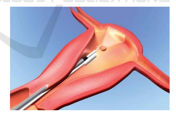
Figure 1: Hysteroscope inserted into the uterus.

transcervical surgery are, in addition to the source of light and suitable optics, given above all by adequate and safe uterine cavity distention with appropriate distension media for visual diagnostics and a suitable type of instrumentation. (Holub, 1999)