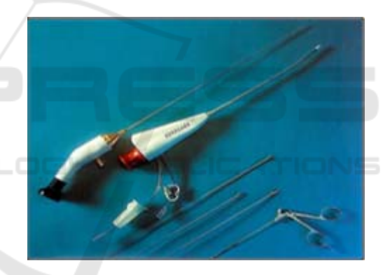
Figure 2: Gynecare Versascope hysteroscope.

The hysteroscope is designed to examine the cervical canal and uterine cavity for diagnostic or therapeutic use. The Gynecare Versascope is used to create and maintain the uterine distension and to gain access to the uterine cavity for the hysteroscope. This tool is shown in Figure 2.