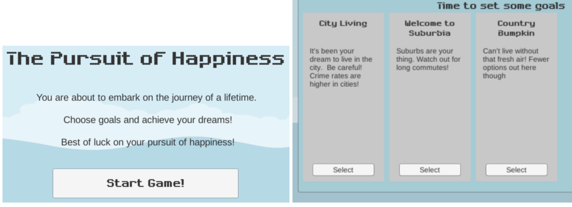
Figure 2: Welcome screen and First Life Goal Screen. The player is given a general overview of the goal of the game and must start by choosing life goals which cannot be changed during the game play.

As stated earlier in this paper, traditional college courses on personal finance do not seem to have a significant impact on financial literacy, but they seem to have some impact on financial behavior (Mandell, 2009). We propose that the reason finance courses do not impact literacy in the same way that they impact behavior is the lack of application. By creating an intrinsic game where students must set goals and employ financial skills to achieve them they will have more grounded learnings that carry with them into real world scenarios. We also hypothesize that such a game can be used for assessment as a better proxy for real world outcomes than existing financial literacy assessment, which is typically exam-based.