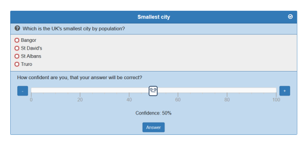
Figure 1: Learning questions with Certainty Rating.

confidence more accurately. Students can share their confidence with a slider between 0 and 100% arranged under the question and possible answers. After selecting the answer(s) and the corresponding certainty in their answer, students can submit both results to AMCS (Figure 1).