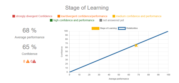
Figure 3: Confidence Rating Visualisation for Students.

between 0 and 100%, for SBC only 0 or 100% are possible. Nevertheless, the total value of summarising all questions is representative for the overall performance of the students. We only include the first answers of LQs in our aggregation, for the second answers the confidence can differ because of the given hints for first wrong answer and more time for re-thinking.