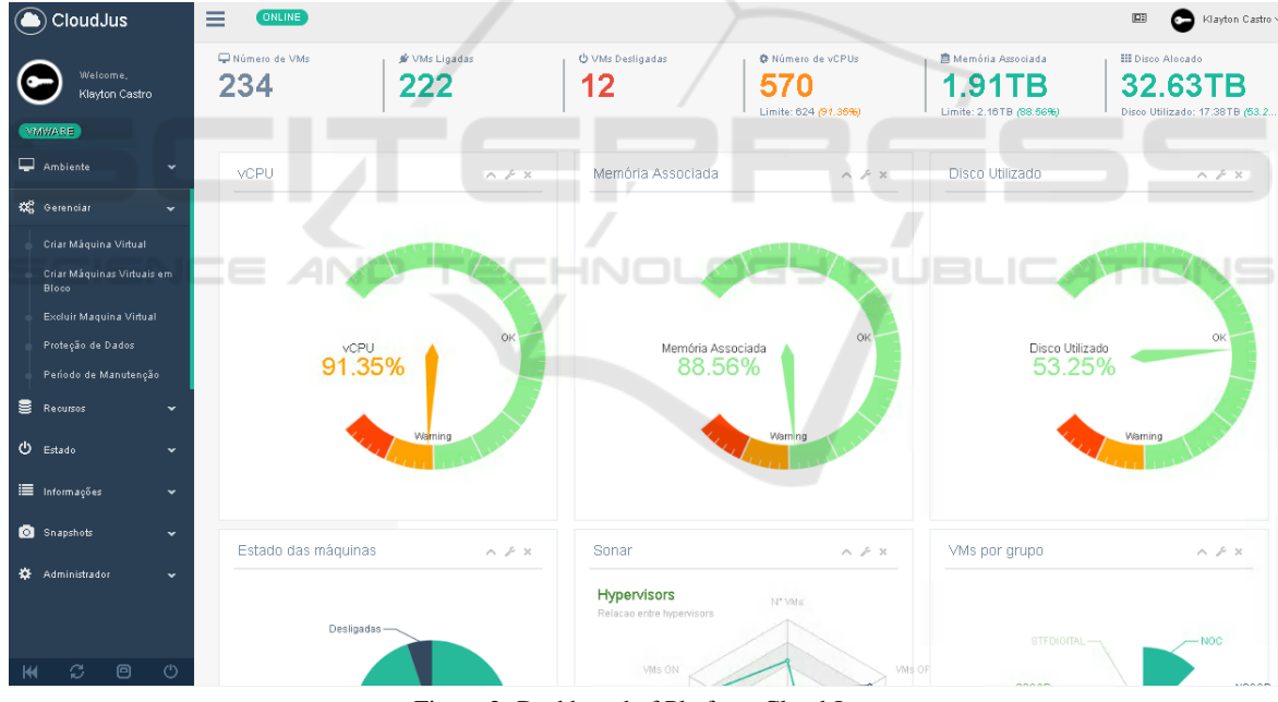
Figure 2: Dashboard of Platform Cloud.Jus.

possible to respond much more quickly to changes than rely on libraries such as libvirt, libcloud, or CMP extensions to integrate with OCCI. During the Cloud.Jus platform deployment at STF, the local virtualization team performed an upgrade on VMware ESXi and vCenter environment, from version 5.5 to 6.5. In just a few minutes, the necessary change for adequacy was implemented easily only in the microservice code associated with this set of hypervi-