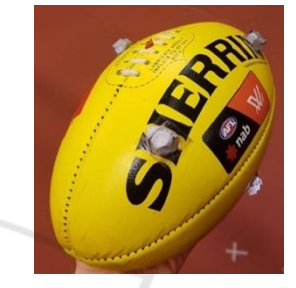
Figure 2: Football reflective marker positions.