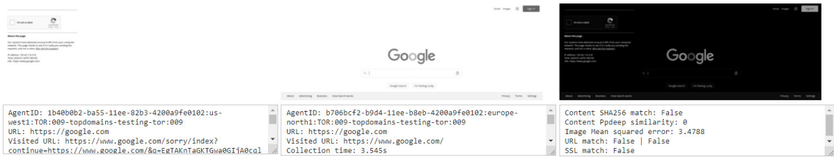
Figure 4: Tor benign domains data set: Google on hxxps://google.com .