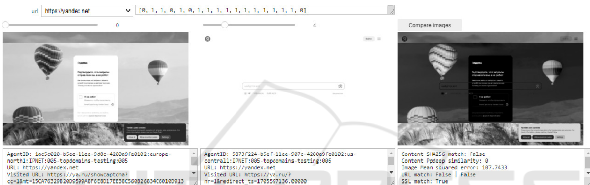
Figure 3: Top benign domain data set: Yandex on hxxps://yandex.net .

nections equally, the exact Tor exit nodes and their geolocation are not known.