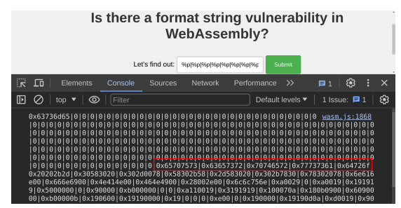
Figure 2: Format String - Arbitrary Read (the highlighted values are the hex representation of the password).

We initiated the client-side exploitation focusing on leaking data from memory. By crafting a payload filled with %p format specifiers, each separated by the "|" character for readability. As Figure 2 shows, the browser's console leaked stack values, among which we find we find the correct password, represented in hexadecimal.