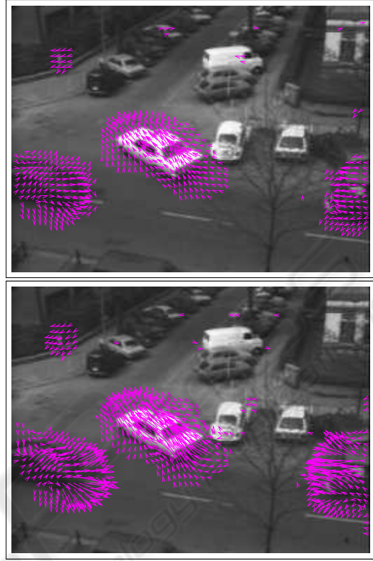
Figure 1: Result on frame 5: D.A. (top), H&S (bottom).

In a first experiment, we compute the optical flow on the sequence using the Data Assimilation method (D.A.). The Horn & Schunk method (H.&S.) is also applied and results, on the fifth frame, are displayed