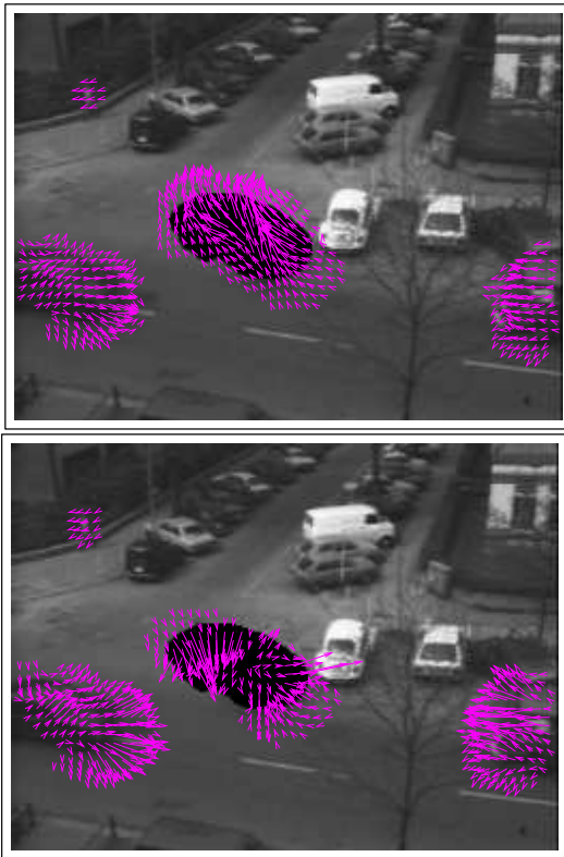
Figure 2: Missing data: D.A. (top), H.&S. (bottom).

A third experiment is dedicated to the demonstration that the evolution model improves the estimation of the image dynamics. For that purpose, we build a synthetic sequence with two squares, one moving horizontally and one vertically. At the end of the sequence, they meet each other. Figure 4 shows the result of both methods at the beginning and the end of the sequence. H.&S.'s method fails to estimate a correct velocity direction when the squares meet. This is a common drawback of image processing method due to over regularization. D.A. however provides accurate results: the evolution model correctly describes the squares dynamics and decreases the effect of spatial regularization.