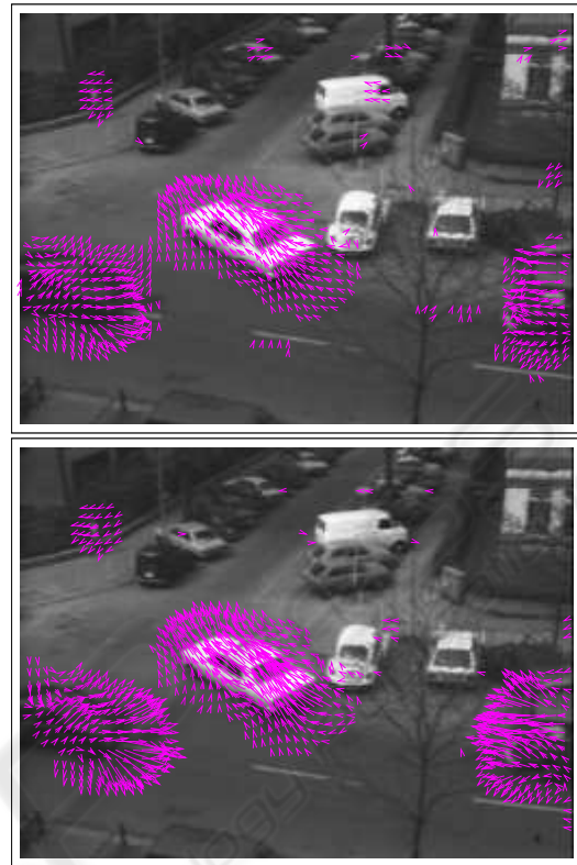
Figure 3: Result with gradients set to zero on frame 5 (top) and with gradient available (bottom).

General principles to choose a suitable evolution model, an observation equation, and their matrices of covariance were discussed in the paper. The ob-