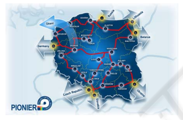
Figure 1: PIONIER Polish Optical Internet.

The metropolitan research and education network POZMAN has been operated by Poznan Supercomputing and Networking Center since 1993. It started as FDDI-based network linking major universities and research institutes in the city. Later, the base technology was changed to ATM, and other types of institutions such as, for example, municipality offices and hospitals were being connected to the network. Today, the network is based on 10 Gigabit Ethernet technology and connects over 100 institutions, including all academic institutions in Poznan, all municipality offices, most hospitals and 23 public schools.