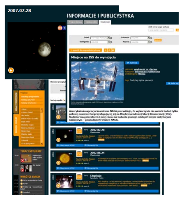
Figure 3: The view at the educational multimedia archive of the Polish public broadcaster TVP.