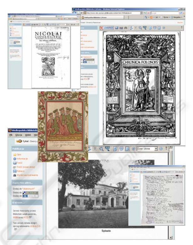
Figure 2: Example publications in the Wielkopolska Digital Library bringing educational value for schools.

regional artifacts, dating back to 13<sup>th</sup> century. Example Wielkopolska Digital Library publications of educational value are shown in Figure 2.