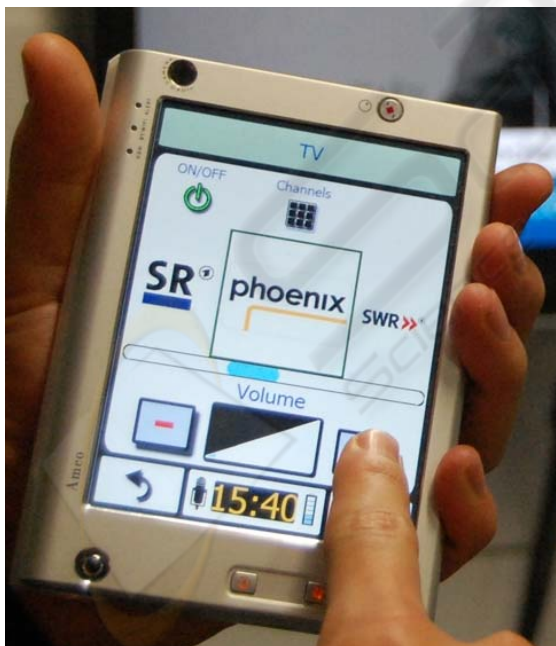
Figure 2: The i2home multimodal UI for smartphones showing interaction with a TV.