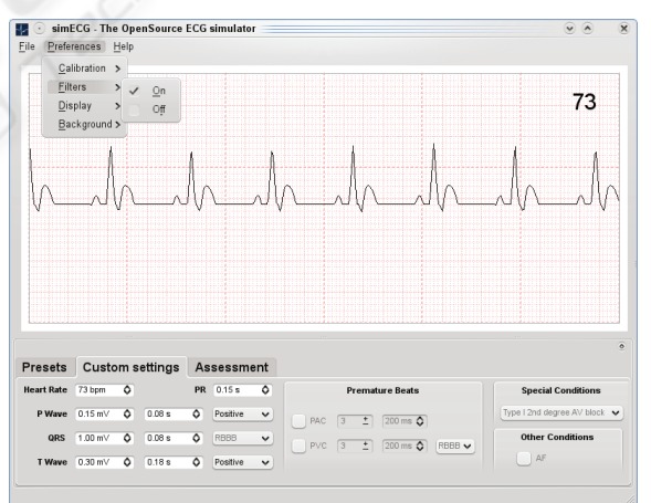
Figure 1: simECG version 1.0 screenshot showing custom settings.

As the first task of the project, we tried to find a simple and flexible way to generate signals that could be similar to those of human ECG with different patterns. Fourier series were selected for representing ECG signals, as any periodic functions which satisfy Dirichlet's condition can be expressed as a series of scaled magnitudes of sin and cos terms of frequencies which occur as a multiple of fundamental frequency. ECG signal is periodic with fundamental frequency determined by the heat beat (Karthik, 2002). Each significant feature of ECG signal can be represented by shifted and scaled versions of waveforms.