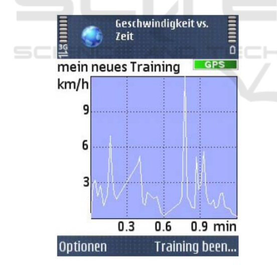
Figure 4: Screenshot from the mobile client.

Additionally the current song and a table with statistics for the training so far are possible screens. A map view showing the position of the user and also the selected trail if desired, can be displayed on the mobile phone as well if a mobile data connection is available.