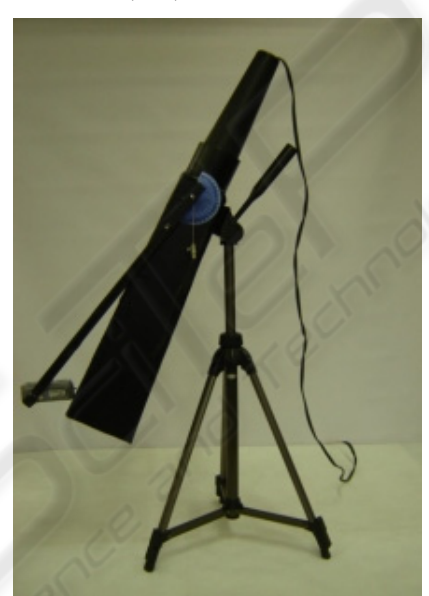
Fig. 2. Illumination device.

A 50cm long pipe, with a light bulb at one end and a 12cm x 20,5cm board with parallel grooves in the other end was constructed. (See Fig. 2 and 3) This device was set at an angle of 20 degrees with the vertical axis to the surface of the cavity. The cost of the device was ca. 130 reais ($72).