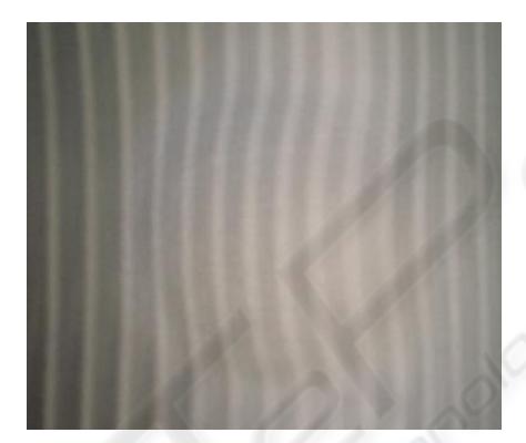
Fig. 4. Cavity image.