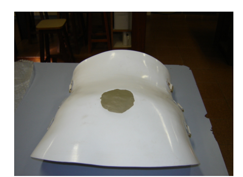
Fig. 1. Adult back model with filled cavity.

A 50cm long pipe, with a light bulb at one end and a 12cm x 20,5cm board with parallel grooves in the other end was constructed. (See Fig. 2 and 3) This device was set at an angle of 20 degrees with the vertical axis to the surface of the cavity. The cost of the device was ca. 130 reais ($72).