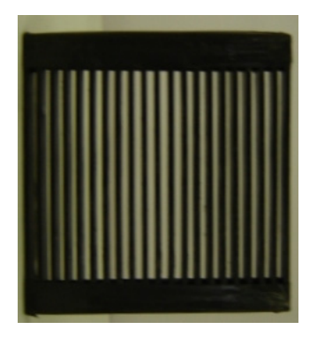
Fig. 3. Board with slots.