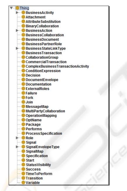
Figure 3: ebXML Business Process Specification Schema Ontology.

In combining the two approaches it seems that there is not a clear correspondence between the classes in the e-Business Specifications ontology and the ebBP ontology. These ambiguities imply that future work is needed in harmonising these two levels on standard ontologies.