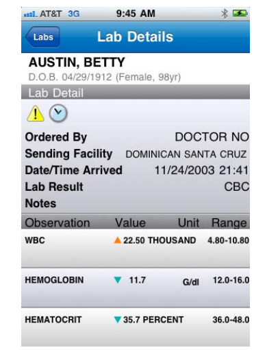
Figure 4: VHR patient's lab results details (iPhone).